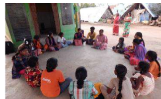
Women Group Children Peace