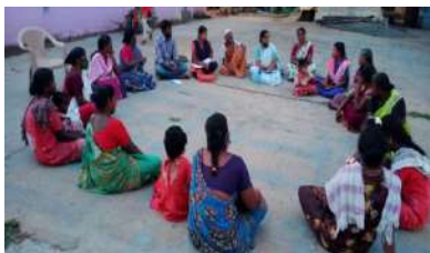
Inter-faith Meeting Club Meeting

Joint Actions for the development of the villages have taken place in Kasi Nagar, Ottapatti, Rajiv Gandhi Nagar and Shakthi Nagar. The Peace Groups came together in their respective villages and submitted memorandums to the concerned Ward Members on issues such as play grounds, toilet facilities, proper drainage system, drinking water etc. The Ward Members have responded positively and the issues are being solved.