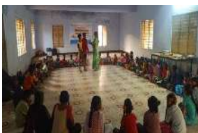
Children's Club Children at Study in Education Centre