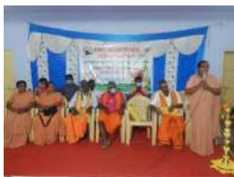
Inter-faith Christmas Inter-Religious Leaders